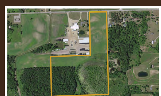
TRACT 2: 39.06 ± ACRES

Soil Types: Boyer loamy sand, Pipestone sand, Boyer loamy sand Soil PI/NCCPI/CSR2: 44 NCCPI