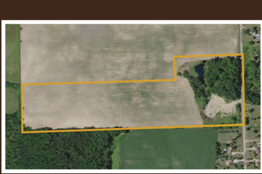
TRACT 7: 39.44 ± ACRES

Soil Types: Marlette sandy loam, Capac loam, Latty silty clay loam