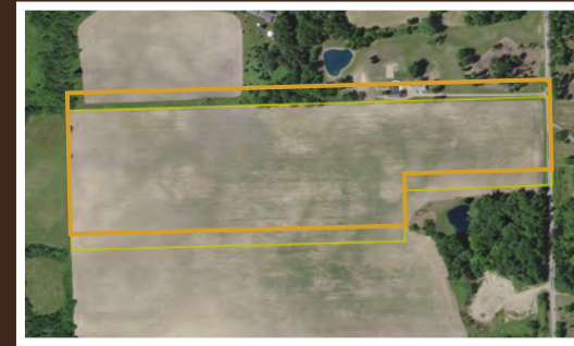
TRACT 3: 41.1 ± ACRES

Soil Types: Marlette sandy loam, Capac loam, Latty silty clay loam Soil PI/NCCPI/CSR2: 68 NCCPI