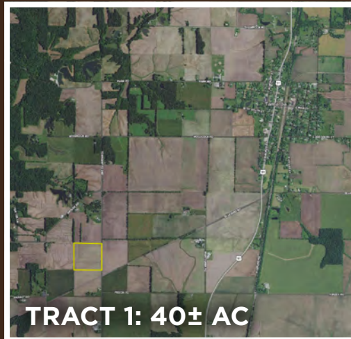
TRACT 1: 40± AC

Farmland auction! 80 acres offered as two productive tillable farms near Pinckneyville with great access. Tract 1 is 100% tillable and Tract 2 is over 85% tillable acres. Buyers to receive portion of 2023 income.