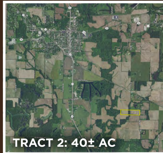
TRACT 2: 40± AC