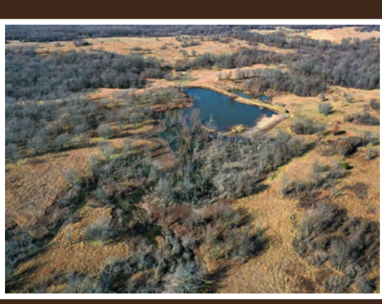
TRACT 7: 80 +/- ACRES