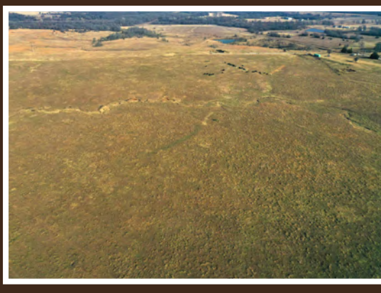
TRACT 4: 40 +/- ACRES