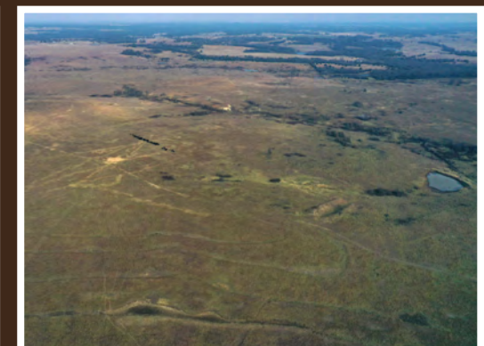
TRACT 2: 120 +/- ACRES