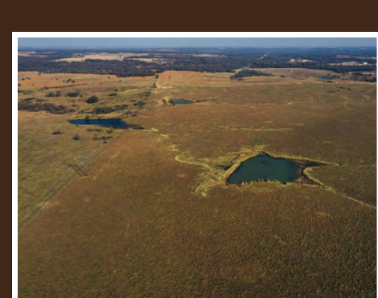
TRACT 6: 80 +/- ACRES