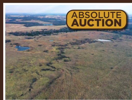
TRACT 3: 219.9 +/- ACRES