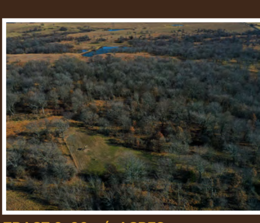
TRACT 8: 90 +/- ACRES